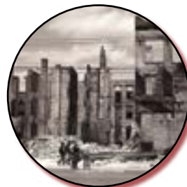
Devastation post riots after ML King's death, 1968