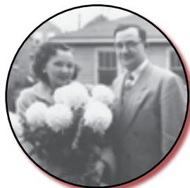
My parents celebrate their 10th anniversary, 1952