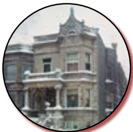
Our first home 4222 W. Washington

Based on a treasure trove of long-hidden family letters, diaries, photos and more, Redlined interweaves the author's coming-of-age story and themes of mental illness, domestic collapse, and devotion to ideals of work and duty with the impact of redlining on both Blacks and Whites. That impact is still with us in the hot contemporary issues of segregation, poverty, and violence.