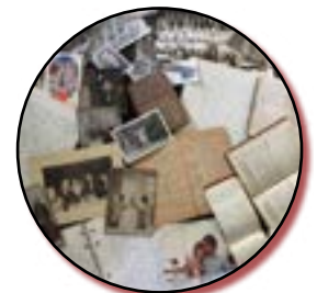
A tiny sampling of the Gartz family archives