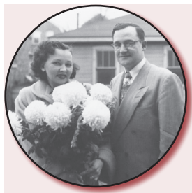
My parents celebrate their 10th anniversary, 1952