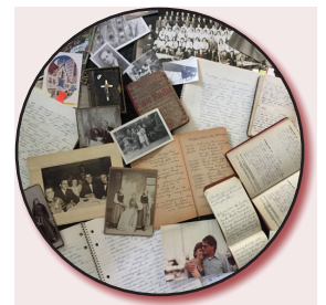
A tiny sampling of the Gartz family archives