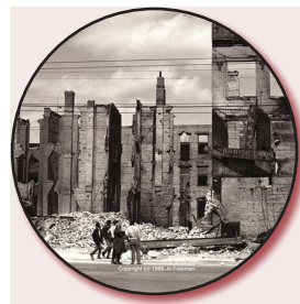
Devastation post riots after ML King's death, 1968